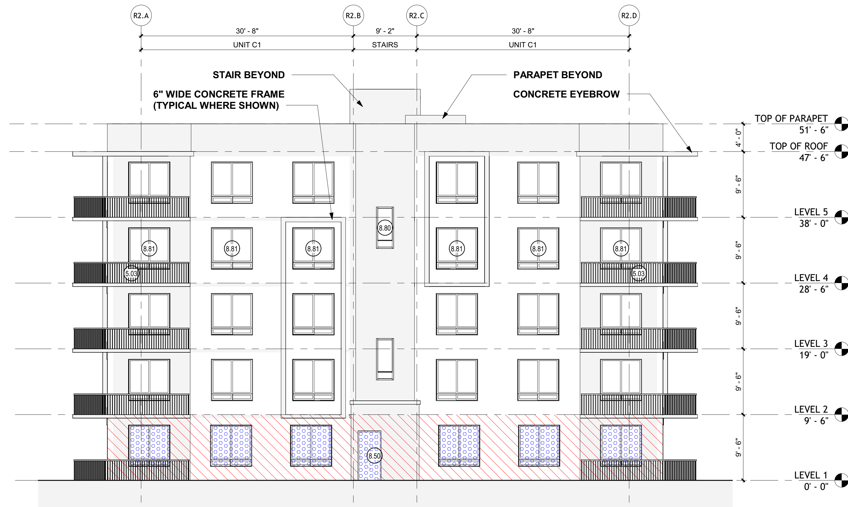
4 BUILDING #1 (EAST), #6 (WEST) FACADE 1/8" = 1'-0"

FENESTRATION/TRANSPARENCY CALCULATION: WALL AREA: 763 SF (100%) FENESTRATION: 239 SF (31%)