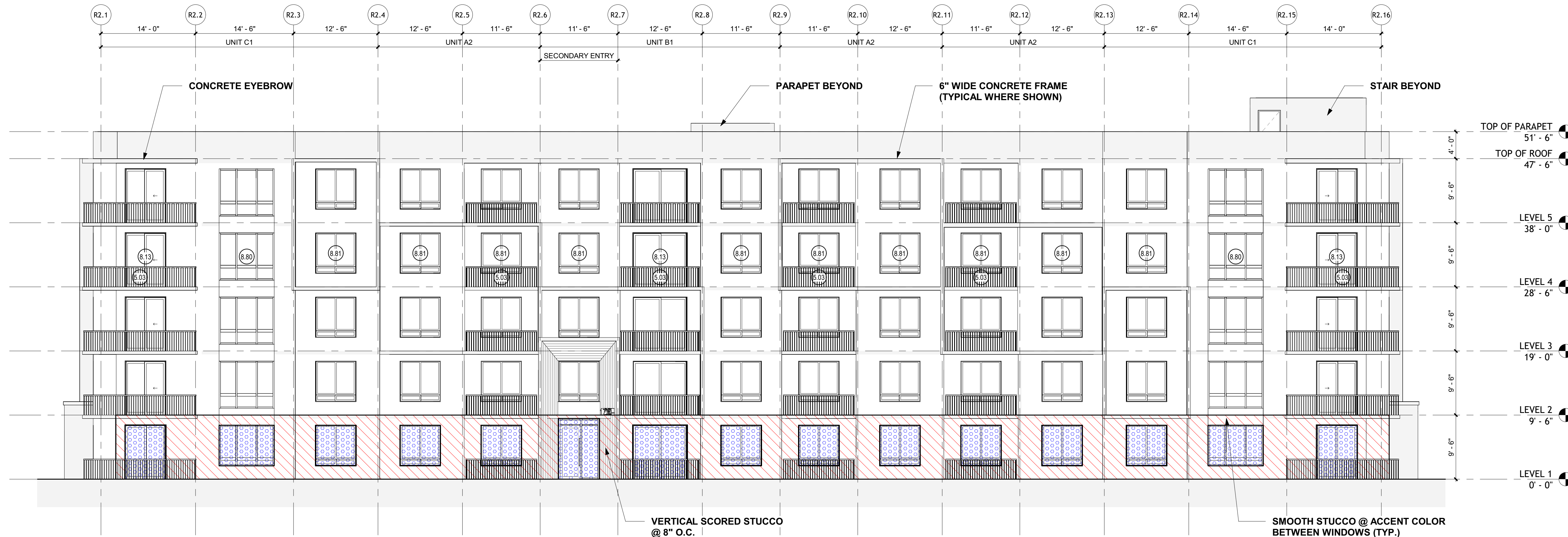
3 BUILDING #1 (NORTH), #6 (SOUTH) FACADE 1/8" = 1'-0"

FENESTRATION/TRANSPARENCY CALCULATION: WALL AREA: 1,790 SF (100%) FENESTRATION: 640 SF (36%)